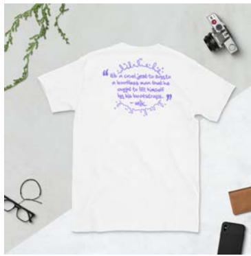
white graffiti (front)