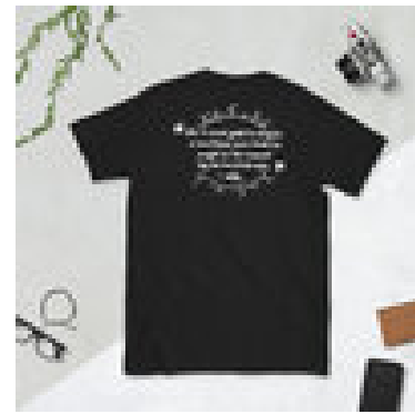
black graffiti (front)